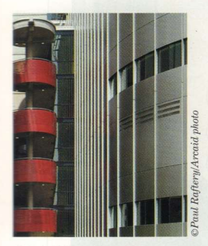
Richard Rogers' new European landmark (page 70).